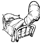
In the Hospital

On Thursdays at 10am we will also have an opportunity to study scripture. We will have a Bible study on Aug 11, 18 and 25. See our Sunday bulletins for more details.