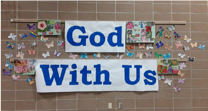
St. John's Sunday School