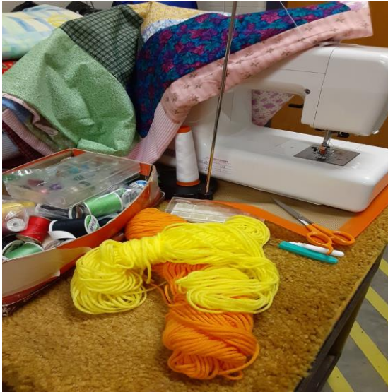
Celebrating 50 years of Quilting at St. John's