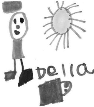
Della Kaderavek, Kindergarten